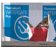
On arrival of doors and windows, cut Watergate at each opening on a 45° angle away from each corner. Pull the Watergate flaps inside and fasten to the inside of frame.